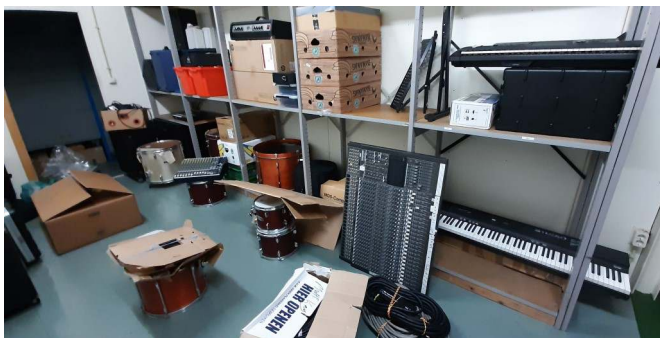
Light, sound and musical instruments for Senegal

In that last container we could send the complete technical inventory of a church that was donated to us. All the light and sound equipment as well as musical instruments have been sent to a project that organizes music events to tell people about Jesus.