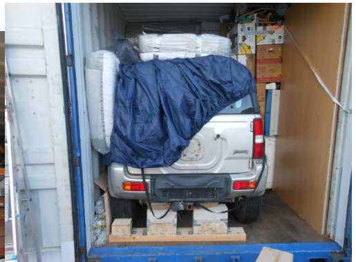
Car firmly loaded on blocks

Wooden blocks under the rear axle and mattresses around the car completed the project.