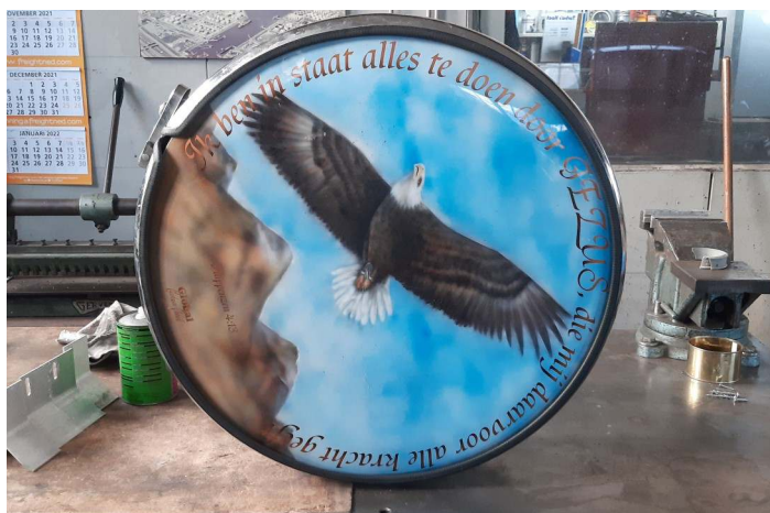
Spare wheel with the appropriate (Dutch) bible verse: “I can do all things through JESUS who strengthens me.”

First, the spare wheel had to be removed with great difficulty because it was better to transport it separately in the container.